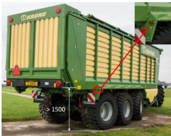
Figure 1 Position of additional reflectors: the lowest position of side reflectors is often above 1500 mm.