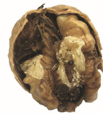
DAMAGED BY PESTS