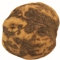
FREE OF BLEMISHES