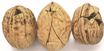
DAMAGE ON SHELL