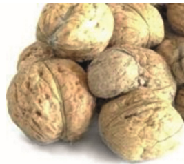
MOULD ON SHELL