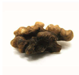
BLEMISHES AND DISCOLOURATION