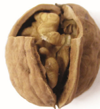
DAMAGED SHELL, EXPOSED KERNEL