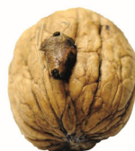
ADHERING HULL / HUSK