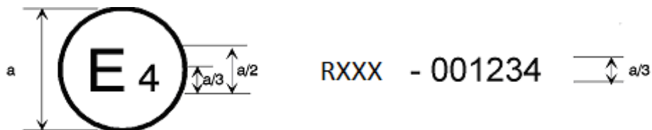
Figure 1 (see paragraph 4.2. of this Regulation)