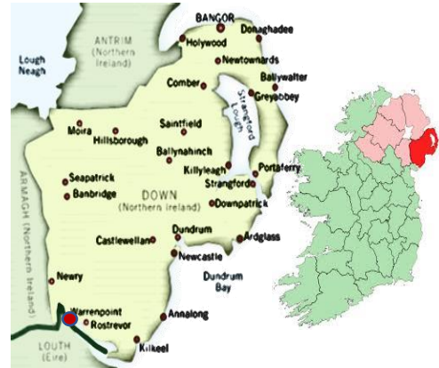
Diagram 1 Location of Warrenpoint in the District of Newry, Mourne and Down in NI