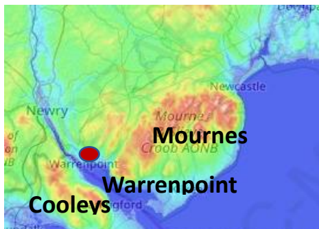
Diagram 3 Topography of South County Down

8. That no consideration has been made as to the topography of the Warrenpoint area in consisting of a dell between two mountain ranges, Mourne mountains within the District to the Northeast and the Cooley Mountains across the border in Ireland to the south. This would create a unique environment where air is ‘trapped’ and therefore should be a priority for monitoring and reporting purposes.