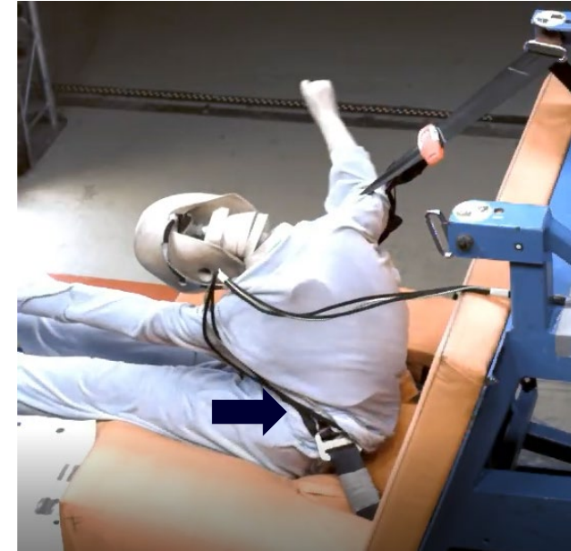
P10 with SKB after 105 ms (right after belt slipping)