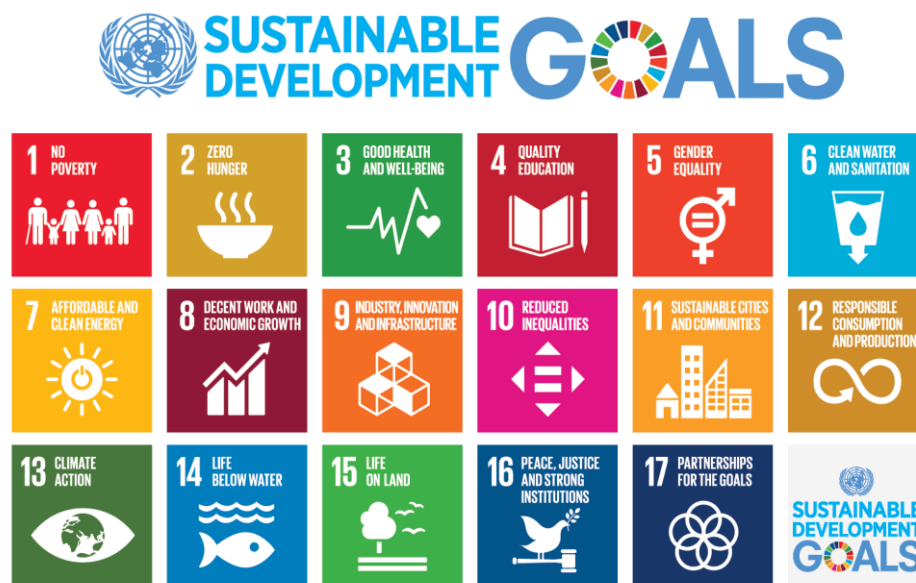
Figure 2. United Nations Sustainable Development Goals

10. The transportation system is integrated in the majority of the goals and has the potential to influence a sustainable society in all three dimensions; socially, economically and ecologically. Agenda 2030 makes it clear that all goals (figure 2) jointly define a sustainable society. Hence the need for solutions that support several of the goals.