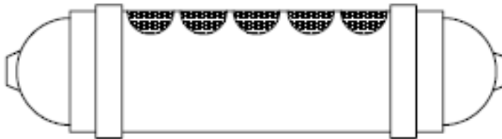
Figure A.1 Cylinder orientation and layout of exposure areas

Although preconditioning and fluid exposure is performed on the cylindrical section of the cylinder, all of the cylinder, including the domed sections, should be as resistant to the exposure environments as are the exposed areas.