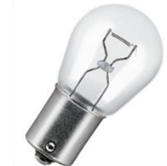
Filament original R37