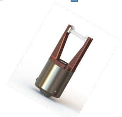
LED substitute R128