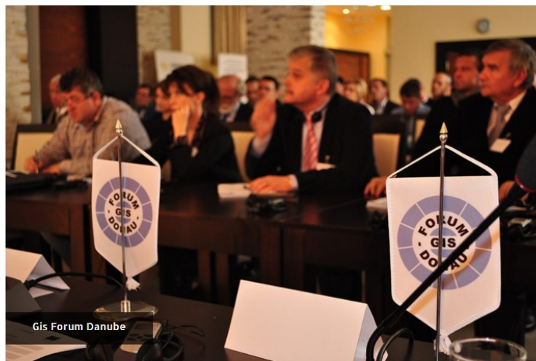
Gis Forum Danube

The "GIS Forum Danube" supervised the projects D4D and DANewBEData. These projects were subsidised for partners of the EU Member States by the European Commission within the Interreg III B CADSES programme.