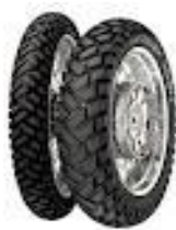
Metzeler Enduro 3