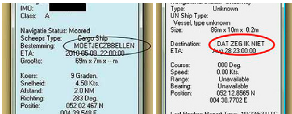
Examples of destination information that are not allowed. 2

sition, speed, course and navigational status. Dynamic information is automatically derived from on-board sensors, and includes GPS, heading, and rate of turn indicators if available. Only the navigational status should be input manually via the Minimum Keyboard and Display (MKD) or via a connected, approved input device supporting the MKD functionality. An approved, specialised firm for installation should be contacted if one of the dynamic information fields is detected to be unreliable.