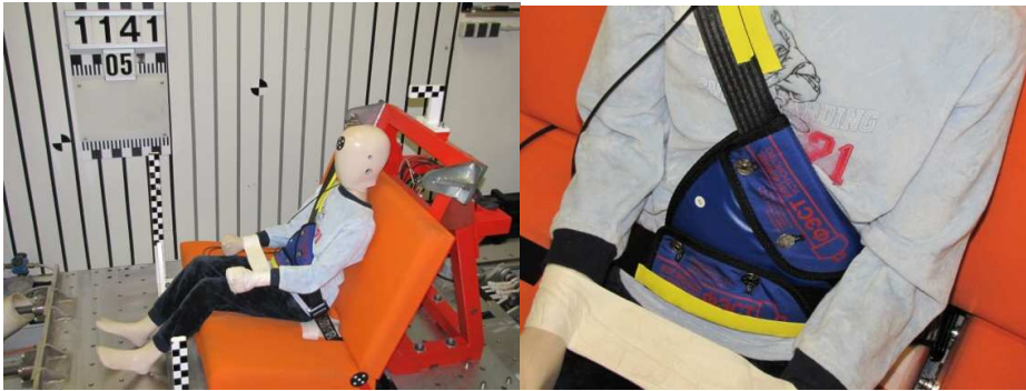
Figure 1: test set-up with belt guide device using the P10 dummy

The system is shown in Figure 1. It consists of a non-rigid flexible material to be used with the vehicle seat belt. The system is sold as a group I, II and III ECE R44 approved.