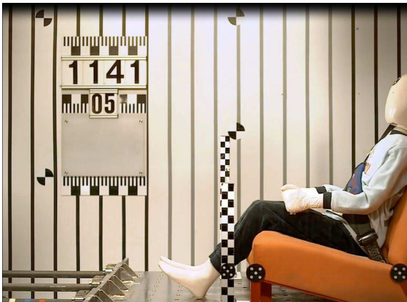
Figure 2a: Time 0 ms – Initial P10 dummy position

The kinematic of the occupant shows that the lap portion of the seat belt is intruding into the abdomen of the dummy, which is a clear indication of a severe submarining (Figure 2 a/b/c). This major shortcoming of such systems is that they can't maintain belt geometry for a proper restraint of the child