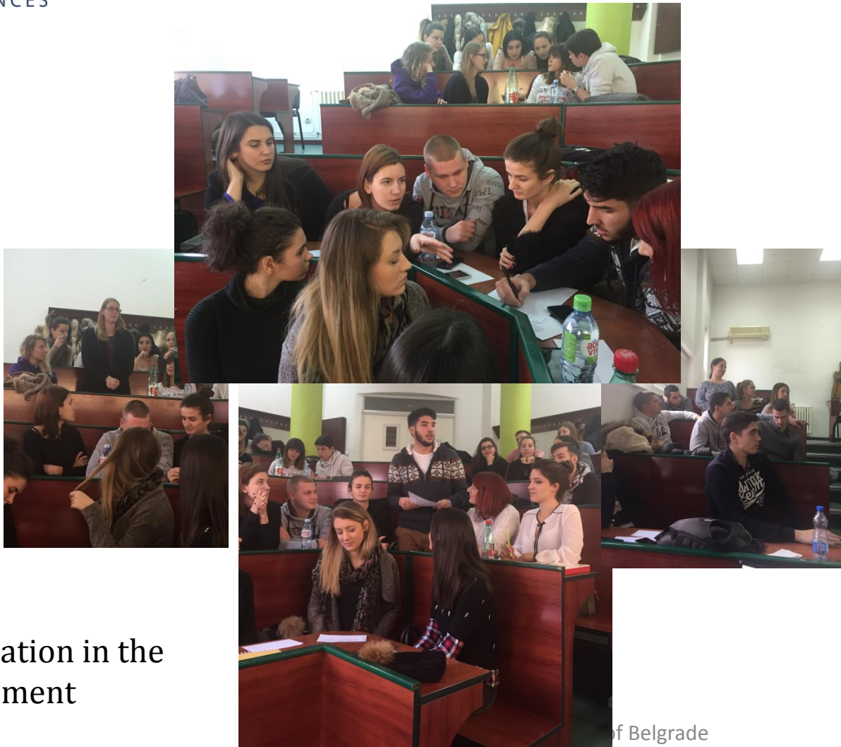
Class workshop: Negotiation in the standard development