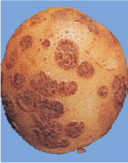
Common Scab (estimated 33.3%)