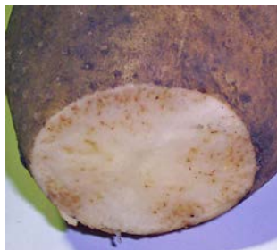
07: Net Necrosis