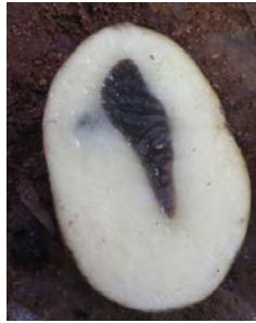
04: Black Heart