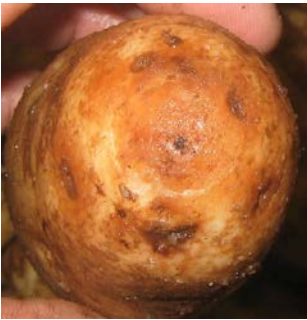
02: Pink Eye