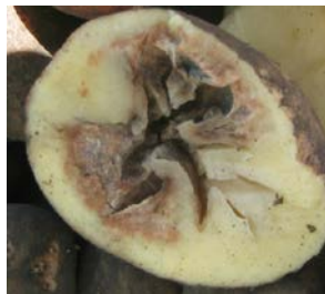
06: Hollow Heart with discoloration