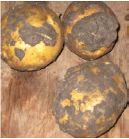
01: Caked Dirt

Defects not in “UNECE Guide to Seed Potato Diseases, Pests and Defects, 2014”