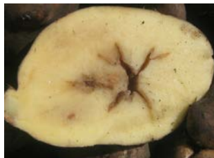
05: Hollow Heart