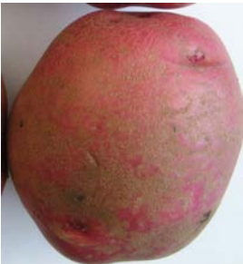
03: Russet Scab