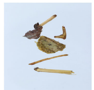
PIECES OF STEM/MINERAL IMPURITIES/EXTRANEIOUS VEGETABLE MATERIALS