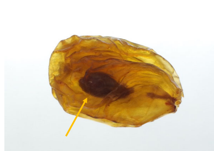
BERRIES HAVING SEEDS IN SEEDLESS TYPES