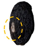
DAMAGED BY PESTS