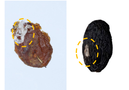
DAMAGED BY PESTS