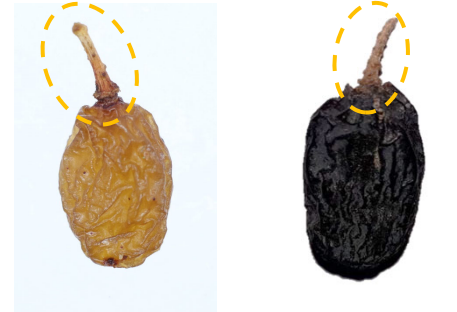
BERRIES WITH CAPSTEM ATTACHED