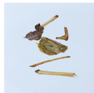
PIECES OF STEM/MINERAL IMPURITIES/EXTRANEOUS VEGETABLE MATERIALS