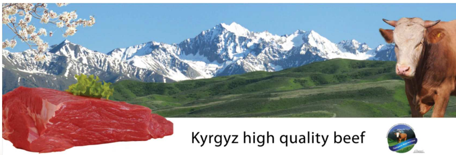
Kyrgyz high quality beef