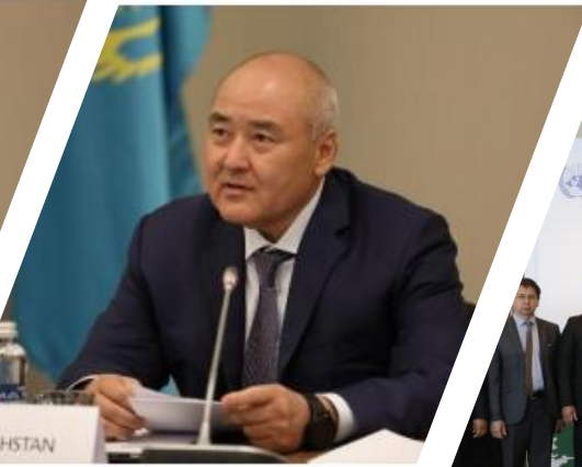
Mr. Umirzak Shukejev, Deputy Prime Minister of Agriculture of the Republic of Kazakhstan