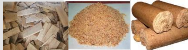
Wood processing residues