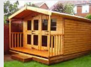
Prefabricated wooden buildings