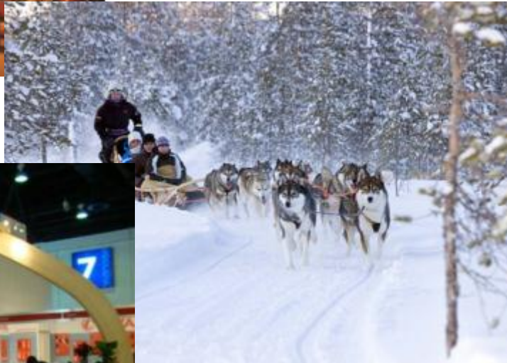
Science Centre Pilke