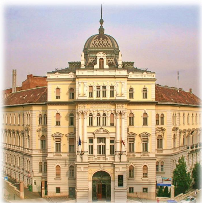
Hungarian Central Statistical Office, Budapest.