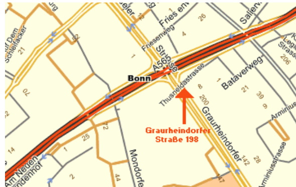
(a larger map is available on page 6)