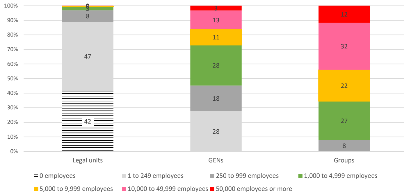
Chart 3: Distribution (%) of the units by size of the legal units, GENS and groups