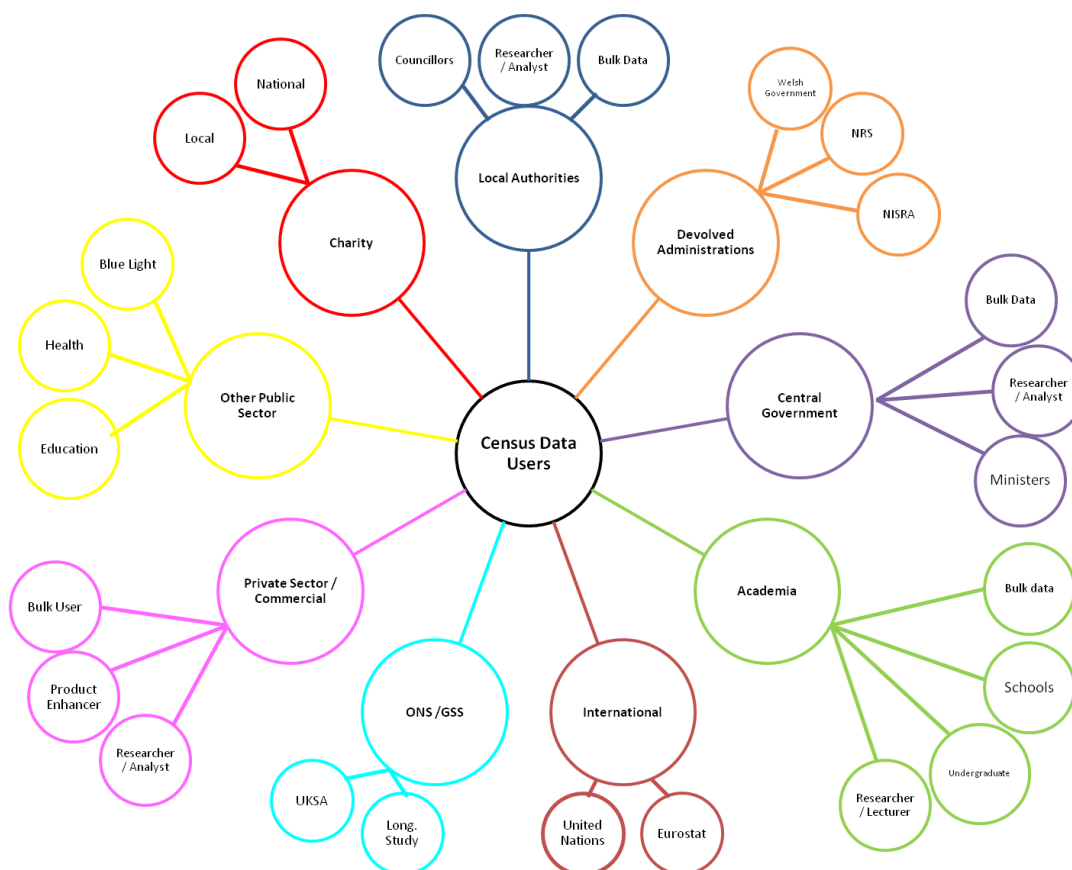
Figure 1 2021 Census Outputs and Dissemination stakeholders

41. Figure 1 illustrates the key stakeholders we seek to engage with, but we recognise there may be other users we have not identified.