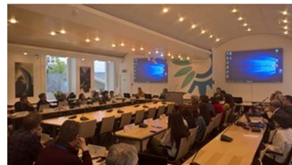
Bern Convention to report on the conservation status of species and habitats under Resolution 8 (2012), EEA, April 2018