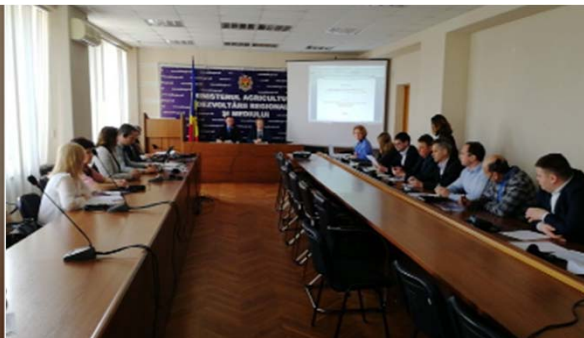
Develop coordinated water information system to support policy-making and water management, Moldova, April 2018