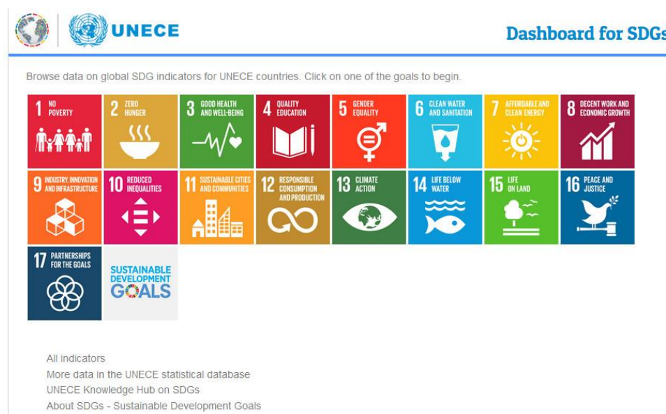
Figure 2 Interface of the Dashboard for SDGs

13. The Dashboard was launched on 13 March 2020. Based on the data presented in the Dashboard, UNECE Statistical Division prepared a report Towards achieving the Sustainable Development Goals in the UNECE region: a statistical portrait of progress and challenges presented at the Regional Forum on Sustainable Development (Geneva, 19 March 2020).