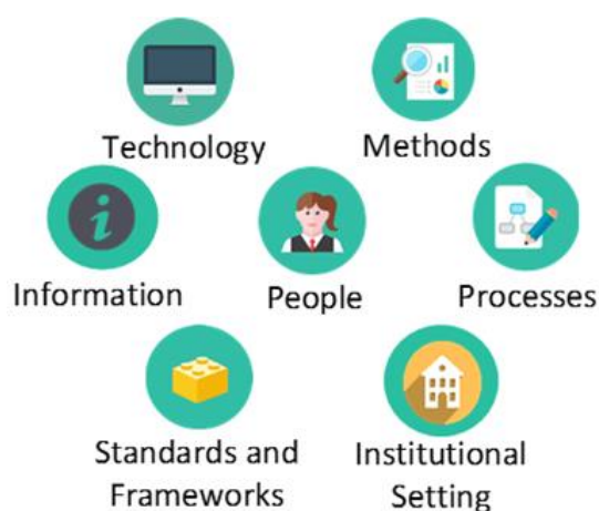
The Seven dimensions of statistical capabilities

17. To improve a capability in a statistical organisation, it is usually necessary to address several of these dimensions. For example, in the case of seasonal adjustment, just training people, or providing a software tool, will not be sufficient to ensure that the organisation has that capability. Capacity development has to take a more holistic approach, taking all seven dimensions into account.