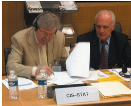
Mr. Vladimir Sokolin, Chairman of CIS-STAT

SPECA was launched in 1998 to strengthen regional cooperation and promote integration of Central Asia into the world economy. As part of the programme, the SPECA Working Group on Statistics has met annually since 2006. In addition, several training programmes by UNECE and the United Nations Economic and Social Commission for Asia and the Pacific (ESCAP) have addressed data quality in Central Asian countries. As a result, Azerbaijan, Kazakhstan, Kyrgyzstan and Tajikistan are currently conducting censuses while Turkmenistan plans to do it in 2012.