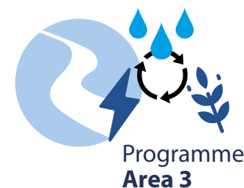
Programme Area 3