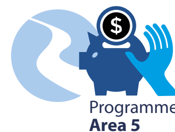
Programme Area 5