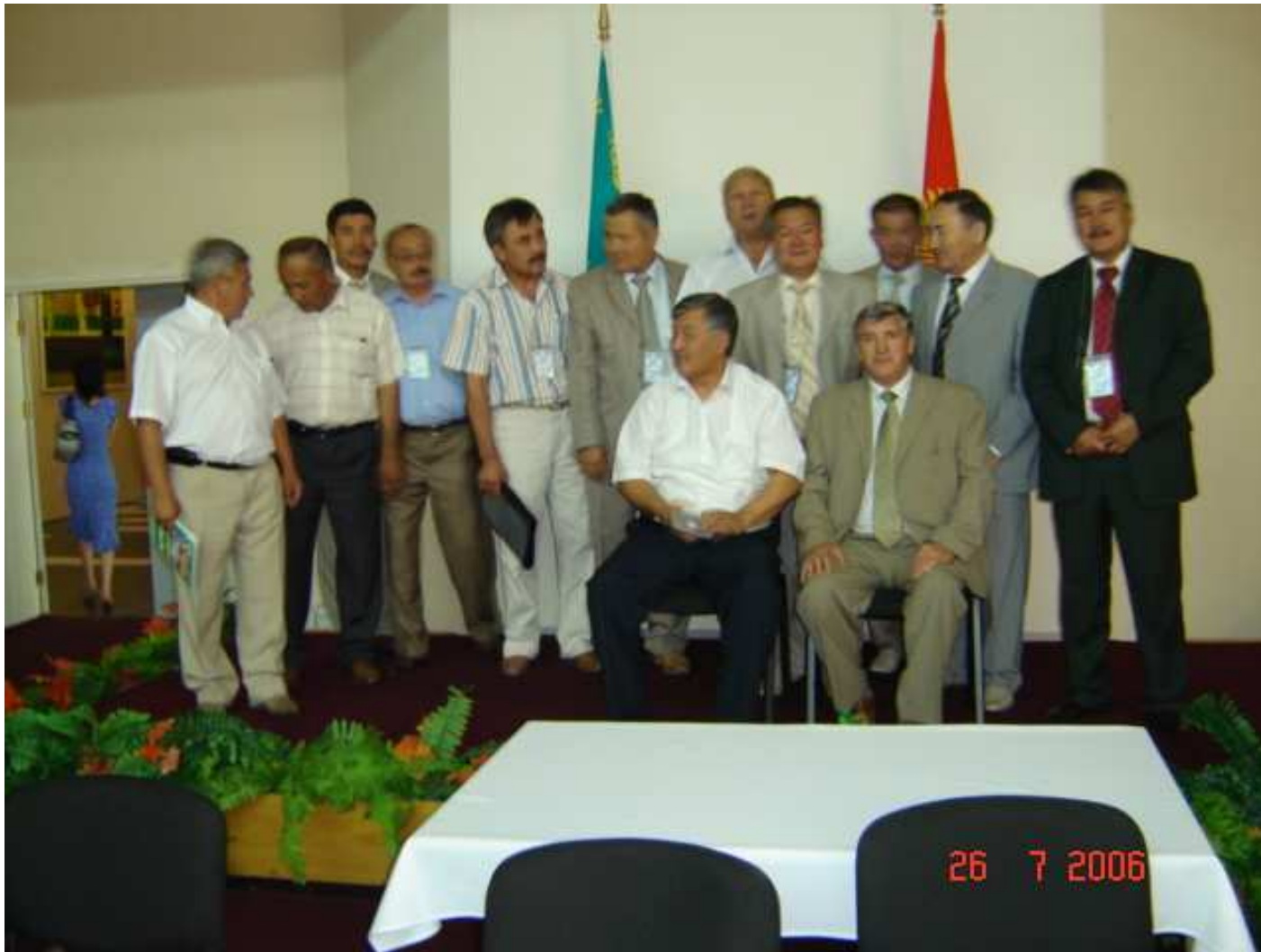
Inauguration of the Chu-Talas bilateral commission 26 July 2006