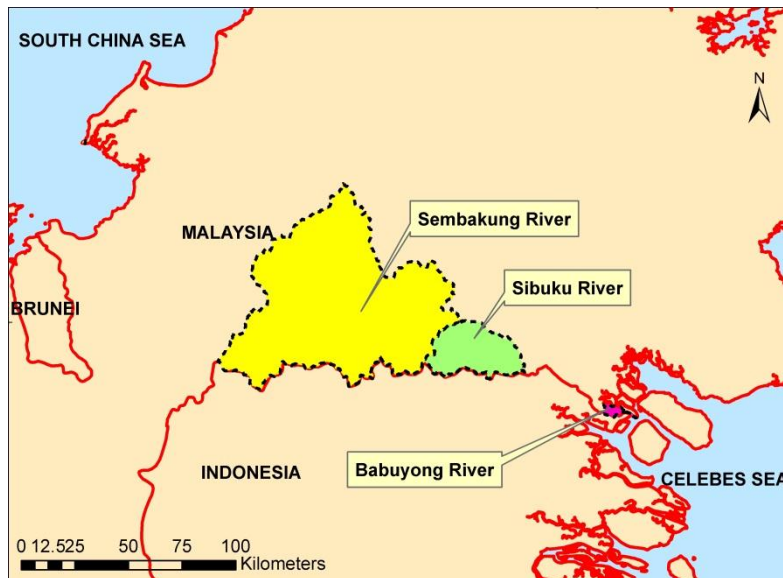
Figure 2: Sibuku River, Sembakung River, and Babuyong River (Malaysia-Indonesia Transboundary Basin)