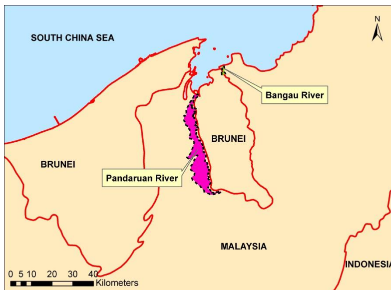
Figure 3: Pandaruan River and Bangau River (Malaysia-Brunei Transboundary Basin)