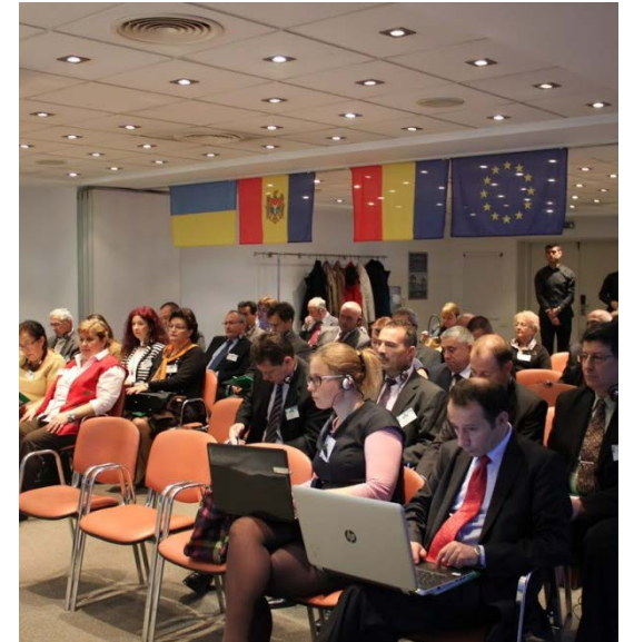
Final project workshop (20-21 Oct 2015), Bucharest