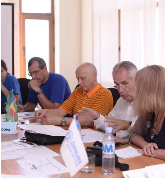
Hazard and crisis management week (23-26 Mar 2015), Chisinau