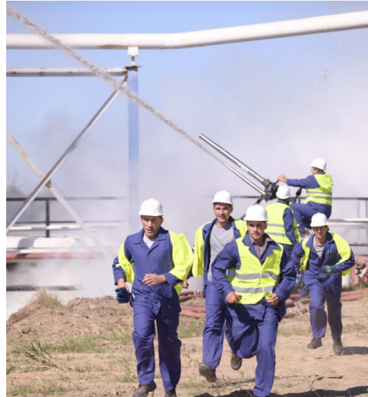
Field exercise in the Danube Delta (1-3 Sep 2015), Giugiuurlesti (Republic of Moldova)