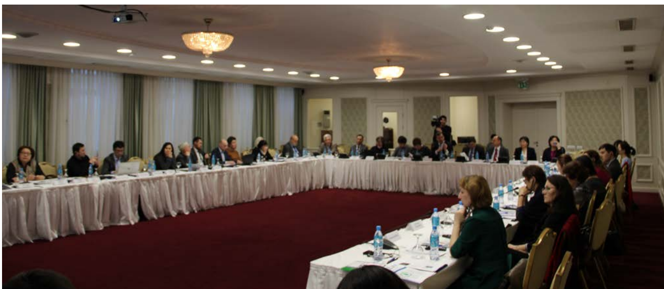
Picture: Numerous stakeholders at the public consultation workshop

Most of the welcoming remarks stressed the importance of the SEA towards better strategic planning, good environmental governance, transparent and efficient decision-making and was considered as a next step in transition to the “green” economy path. The representatives of the Parliament of Kazakhstan and the Ministry highlighted the need and importance of the pilot project in promoting “green” legislation and environmentally friendly fuel and energy complex. The co-operation and mutual assistance among the interested parties in this framework were noted as important prerequisites for the success of SEA introduction in Kazakhstan and possible future ratification of the UNECE Protocol on SEA.