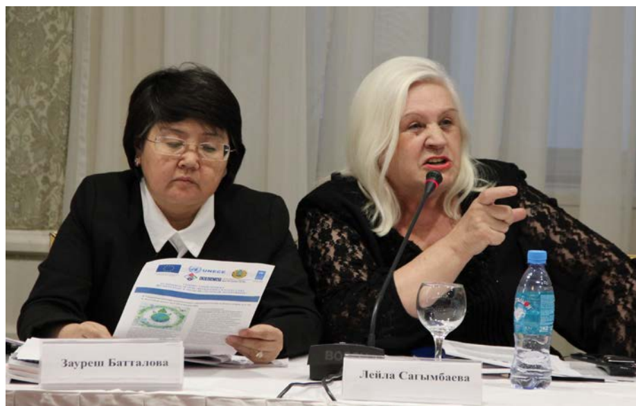
Picture: Non-governmental organizations discuss the findings of the Scoping report

The next session was held by SEA national team, namely by the national consultants in the areas of strategic planning, EIA, biodiversity, energy security and health protection through a joint presentation on the scoping findings and results. They spoke about the likely main impacts of the sectors of electropower, coal, oil and gas and uranium mining on the aspects of environment (air, water, soil), biodiversity and health. Initial recommendations were formulated by the national consultants for consideration of the Ministry and interested stakeholders. The participants were requested to provide comments and suggestions in written form to the attention of the Ministry at the address, indicated in the Scoping report.