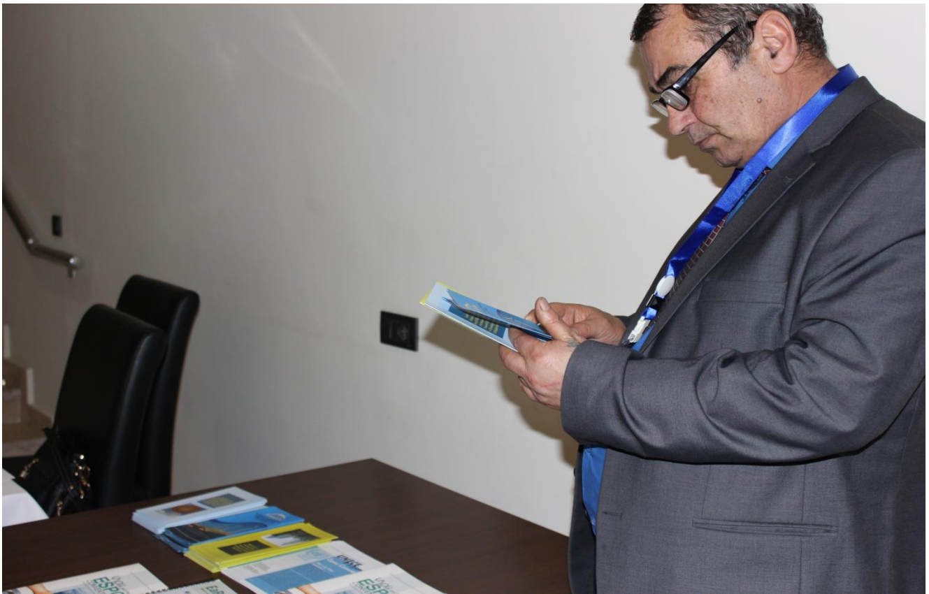
SEA pilot project - Final public consultation workshop