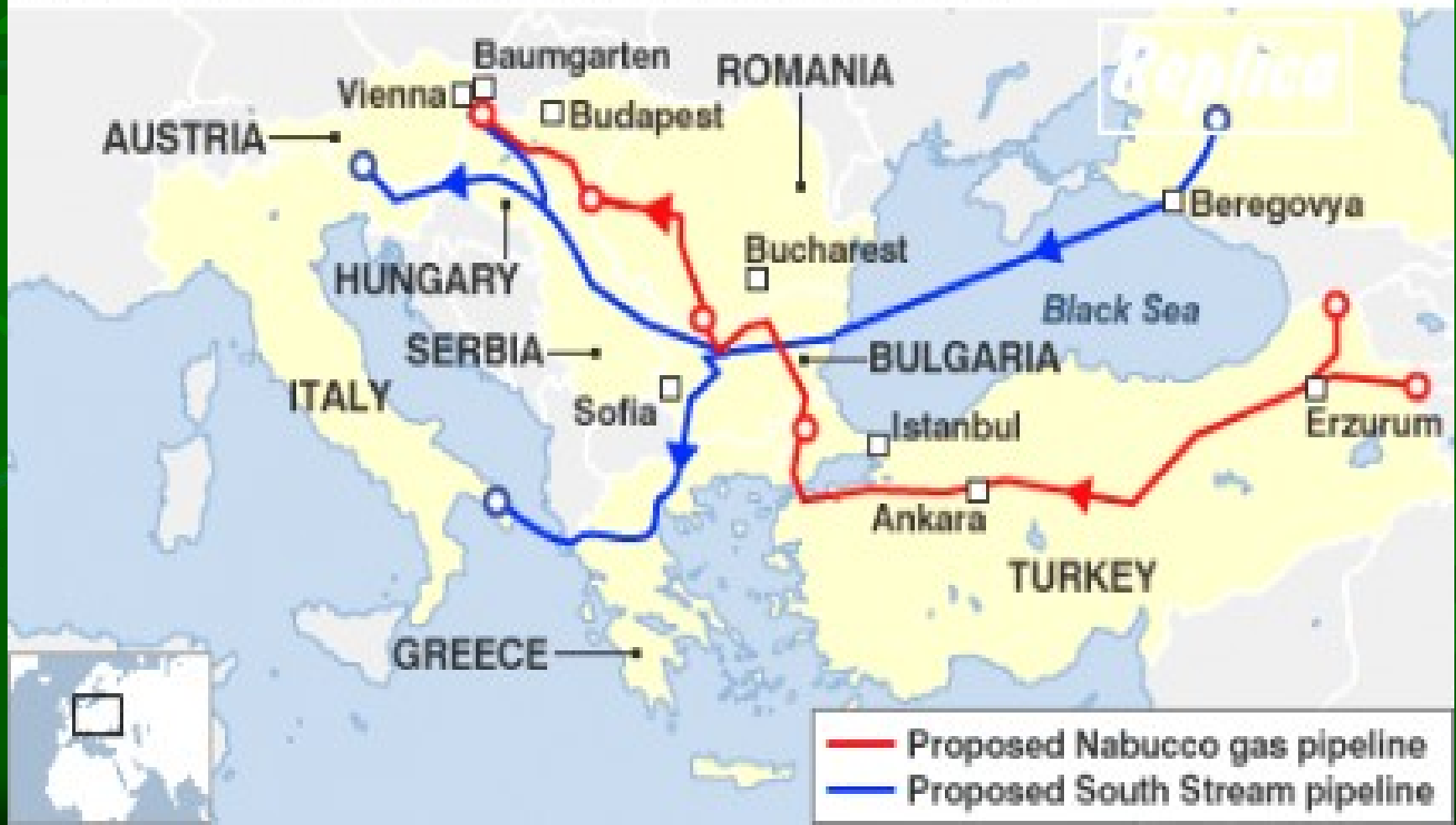
PLANNED SOUTH STREAM AND NABUCCO GAS PIPELINES