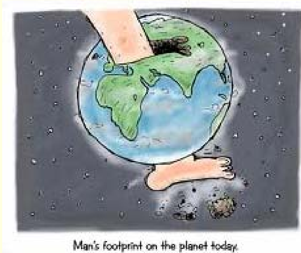
Man's footprint on the planet today.