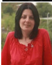
Sophie Tchitchinadze Georgia's Environmental Outlook