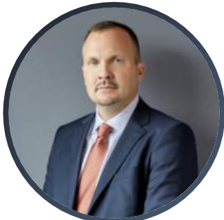
JOHN HOWCHIN Secretary-General, Council on Ethics Swedish National Pension Funds