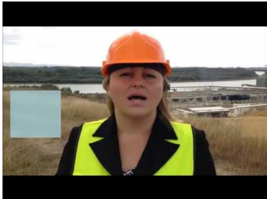
“From Sandoz to Sendai: From managing disasters to managing risks”