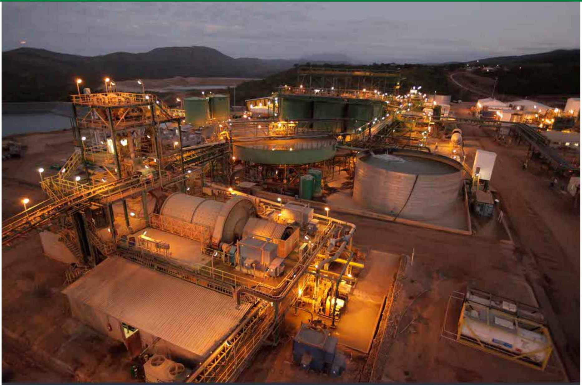
Figure 3: Kayelekera Uranium Mine in Malawi