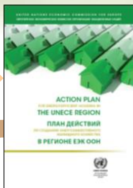
UNECE Action Plan