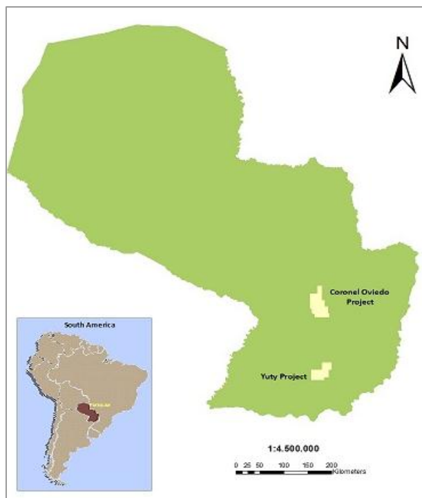
Location of known uranium occurrences in Eastern Paraguay