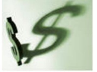
Publicity / funding