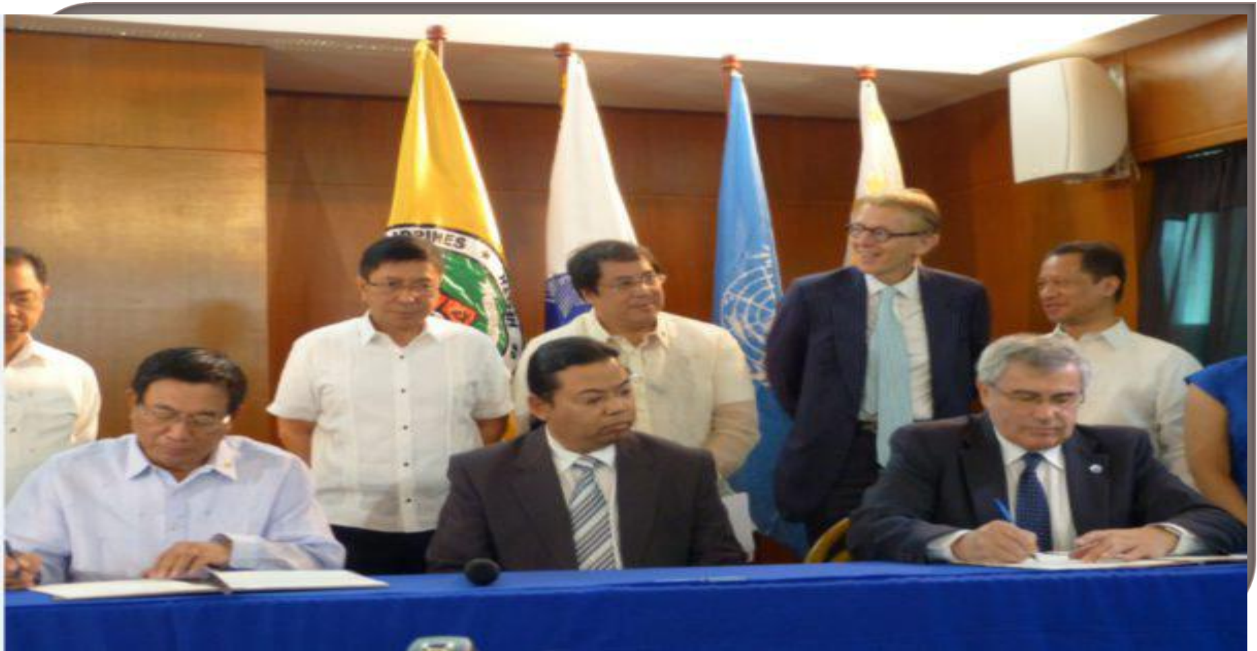
Formal Signing of the Memorandum of Understanding