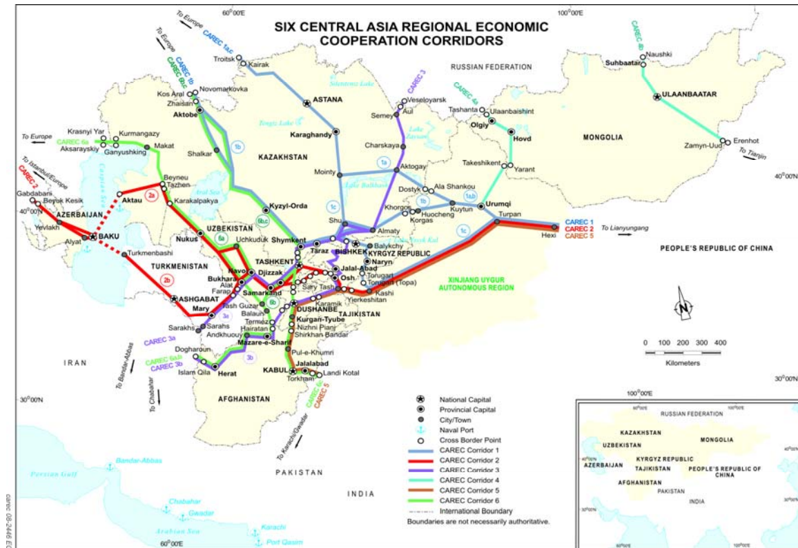
CAREC Regional Economic Cooperation Corridors

4.5. With the identification of these two transport corridors, Afghanistan is directly involved in the CAREC continental corridors programme as well as with the corridors identified in the UNECE-ESCAP 2008 EATL Study.