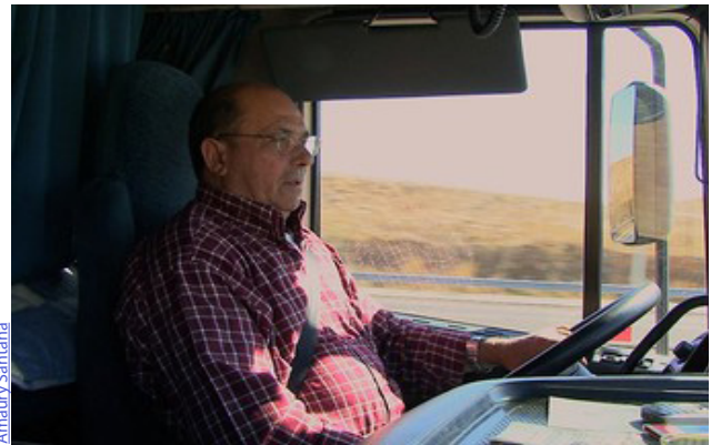
Life on wheels: long-haul truck driver in Spain