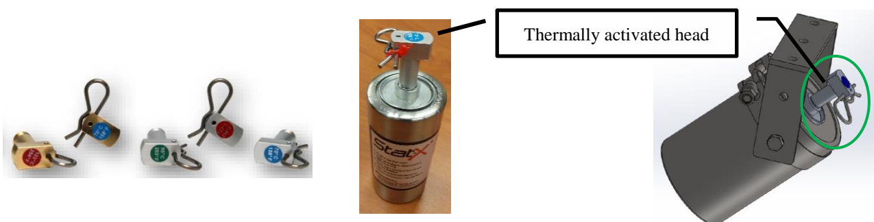
Figure III: Picture of various thermal head units. Diagram of how the thermal activation unit is installed on the aerosol generator, AT THE TIME of installation