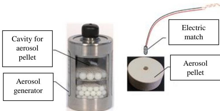
Figure I: Typical aerosol generator components

Figure I shows the typical components that make up the aerosol generator. The electric initiator is installed through the top of the unit, resting inside the aerosol pellet. The electric initiator consists of an electric match and a gel capsule filled with a small amount of explosive powder. The electric initiator is shorted and stored under the protective cap for shipment, shown in Figure II. It cannot be accessed by any electrical charge during shipment. In this scenario, the largest electric initiator contains approximately 4.4 grams of explosive, contained powder.