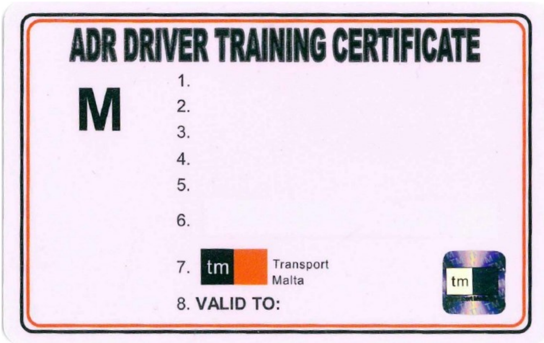
Malta's proposed ADR Training Certificate

This is the current ADR Training Certificate as per 8.2.2.8.5