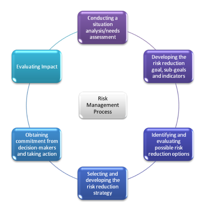
Risk Management Process