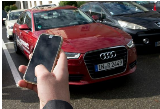
Demonstration in the Palais des Nations on 16 September 2015

6. The expert from OICA introduced GRRF-80-18 (i) presenting the system and those Regulations relevant for the type-approval of this system, (ii) concluding that RCP could be type-approved according to Regulations Nos. 79 and 13-H and (iii) in line with the requirements of the 1968 Vienna Convention on road traffic. The expert of GRRF expressed first positive comments about the systems and agreed that clarifications should be added in the relevant Regulations to capture the benefits of such systems without compromising safety. GRRF noted that even though correctly type-approved, such system would still be subject to regulations related to the use of road vehicles.